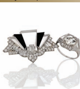
Specialising in Art Deco Jewellery and Antique Silver.