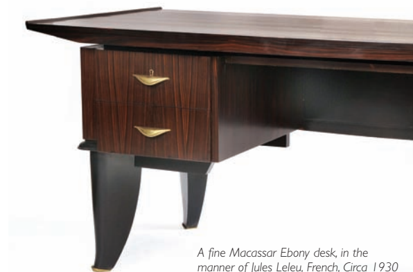
A fine Macassar Ebony desk, in the manner of Jules Leleu, French, Circa 1930

Decorative Arts, Design, Objects & Fine Art