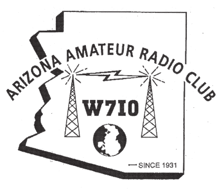
... CATCH THE FEVER !